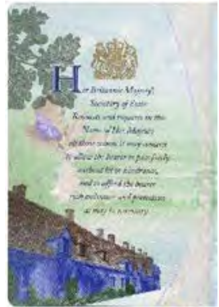
Printed inside front cover, GBR passport

Passports which have been dismantled to remove the pages will often contain empty stitch holes where the original thread used to be. In addition the stitch holes of the page which has been inserted may not match those of the document, again leaving vacant holes.